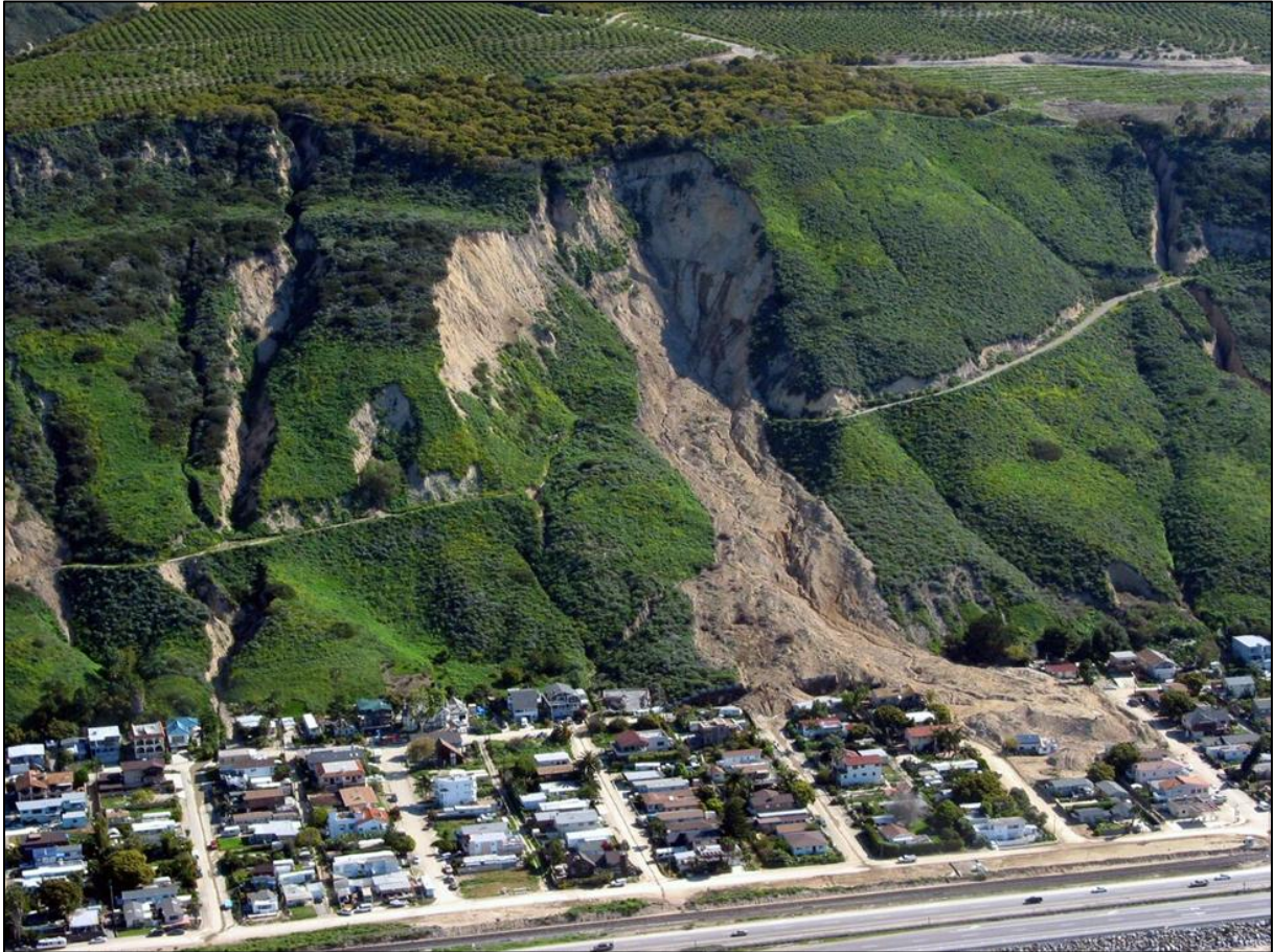
Figure A2: Remnants of a landslide that took place in La Conchita, California, USA (January 2005). Ten people were killed.

( https://d9-wret.s3.us-west-2.amazonaws.com/assets/palladium/production/s3fs-public/styles/full_width/public/LaConchita_USGS_Photo.jpg?itok=NS7eb4YQ )